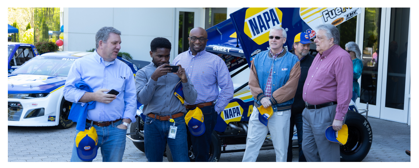
We celebrated Teammate Appreciation Day at our corporate headquarters in Atlanta. Teammates enjoyed outdoor games, tasty treats and meet-and-greets with the NAPA Auto Parts racing team!

As the pandemic continues to impact our stakeholders around the world, our dedication to health and safety has not wavered. We continue monitoring and following best-practice guidance for managing the effects of the pandemic while ensuring the safety and well-being of our teammates, our customers and the communities where they live and work.