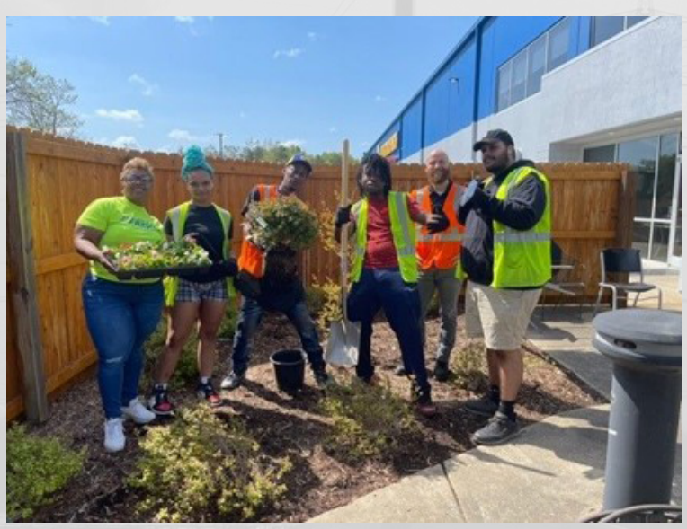
The teams at our NAPA Nashville and NAPA Memphis distribution centers planted trees and flowers at their facilities to celebrate Earth Day.