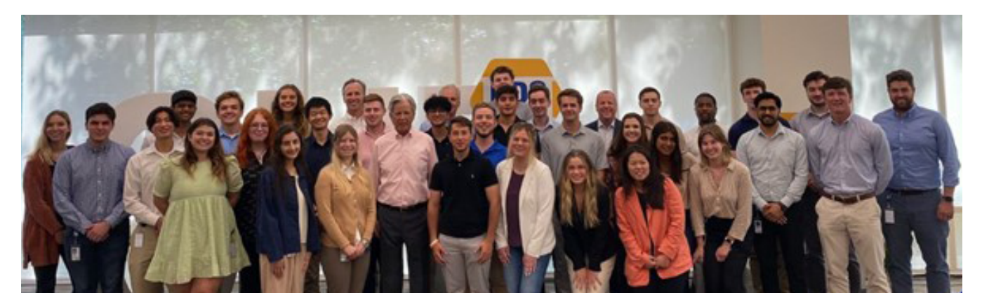
We proudly support future leaders in their professional development. The 2022 intern class spent 10 weeks learning about many areas of our automotive and industrial businesses.

GPC Asia Pacific Scholarship Program: During the pandemic, the GPC Asia Pacific Charitable Foundation launched a scholarship program in Australasia to support people who want to learn skills that could lead to full-time employment. After an initial pilot phase, the program is ready for a national rollout.