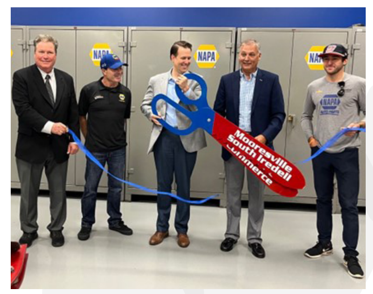
We unveiled a new state-of-the-art transmission classroom at UTI's Mooresville, North Carolina, campus, which is also home of the NASCAR Technical Institute.

NAPA is now the preferred auto parts supplier for UTI's 13 campuses, which include its best-in-class NAPA Autotech training program. We are supplying essential parts for hands-on labs, including brake kits, rotors, bulbs, bearing kits, wheel weights and more.