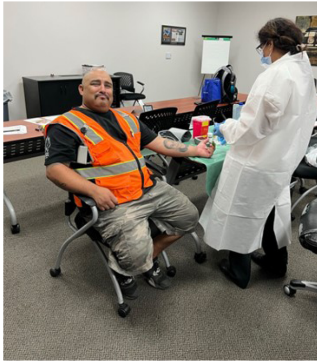
Our team at NAPA Los Angeles distribution center provided on-site biometric screenings with refreshments for teammates.