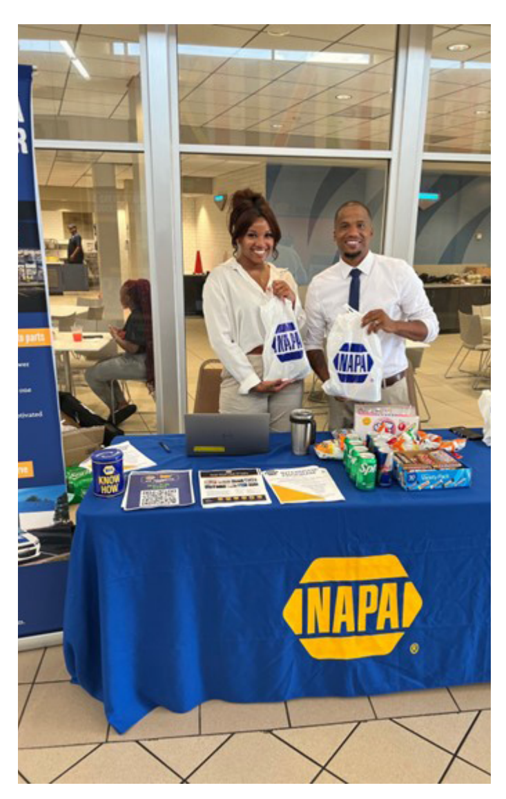
Our Talent Acquisition team visits colleges and universities, like Savannah State University, to meet students and educate them about our career opportunities.