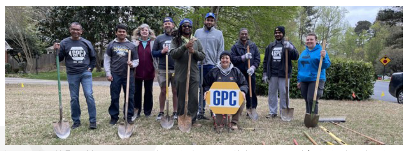
In partnership with Trees Atlanta, teammates volunteer to plant trees and help create a green infrastructure in our hometown.