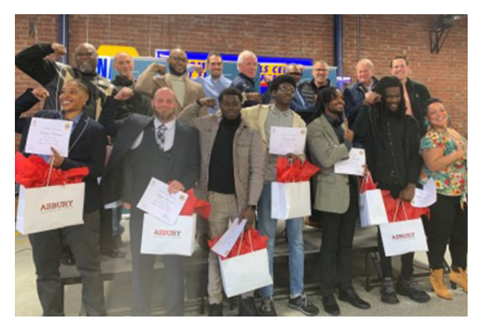
We are proud of class #14 which graduated from the NAPA Auto Skills Training Center during the summer of 2022. All graduates secured employment at independent shops, metro Atlanta dealerships or other partner employers seeking qualified teammates.

Participants receive instruction in ten different areas of auto mechanics and help with job placement after graduation. The accomplishments of this incredible group of newly trained automotive technicians include the CDX Auto certification, multiple SP2 certifications, MAC609 and the entry MLR ASE certification