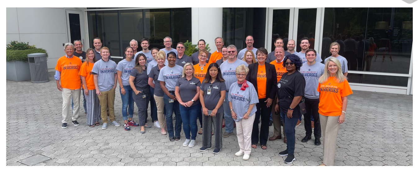
Our teammates proudly support the Intrepid Fallen Heroes Fund, and in 2022, they donated to the "We Believe in Heroes" campaign to build centers for service men and women fighting traumatic brain injuries.