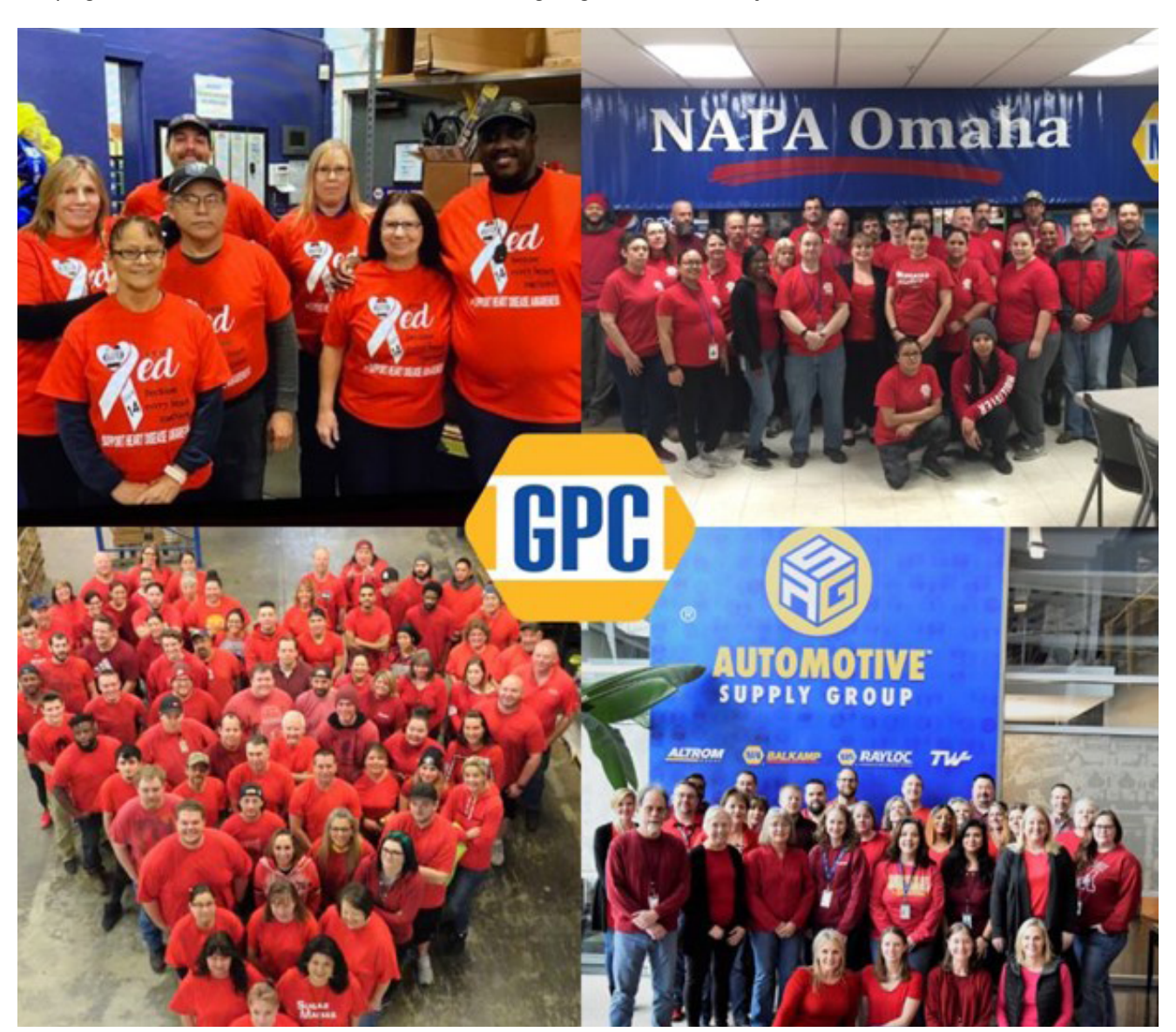
To support the American Heart Association, our teammates celebrated Wear Red Day to raise awareness about cardiovascular disease.